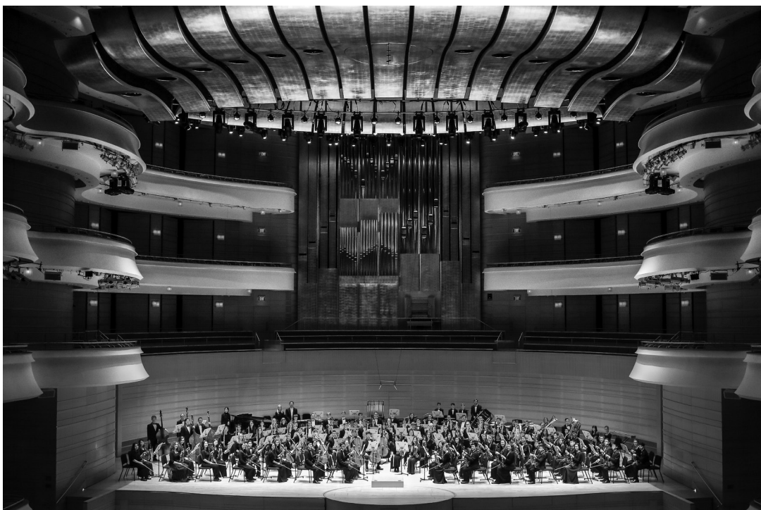
SCYSO Grand Concert 2016 – Renée and Henry Segerstrom Concert Hall

Ontario, Saturday 10 a.m. – 12 p.m. Oaks Middle School 1221 S. Oaks Avenue, Ontario, CA 91762